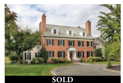
BERNARDSVILLE $2,450,000 5 Beds | 5.2 Baths | 5.52 Acres | MLS 3223549

Serving the needs of my clients through experience, dedication and discretion.