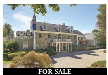
BERNARDSVILLE $2,795,000 5 Beds | 6.2 Baths | 5.37 Acres | MLS 3336447