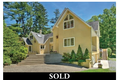
MENDHAM TOWNSHIP $799,000 4 Beds | 4.1 Baths | 3 Acres | MLS 3315849