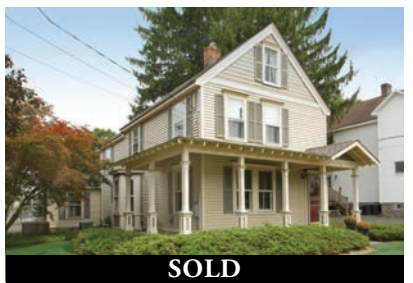
PEAPACK-GLADSTONE $519,000 3 Beds | 2.1 Baths | 0.23 Acres | MLS 3251688