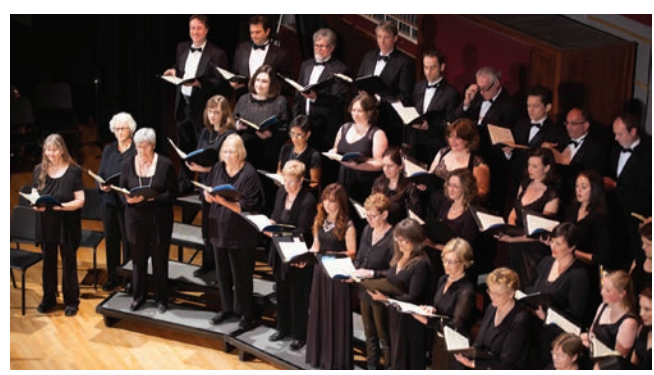
The Somerset Hills Community Chorus