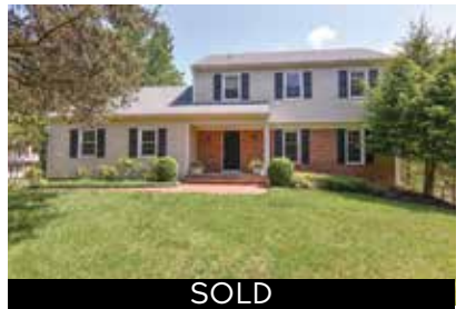
PEAPACK-GLADSTONE $649,900 4 Beds 2.1 Baths 1.2 Acres MLS 3379901