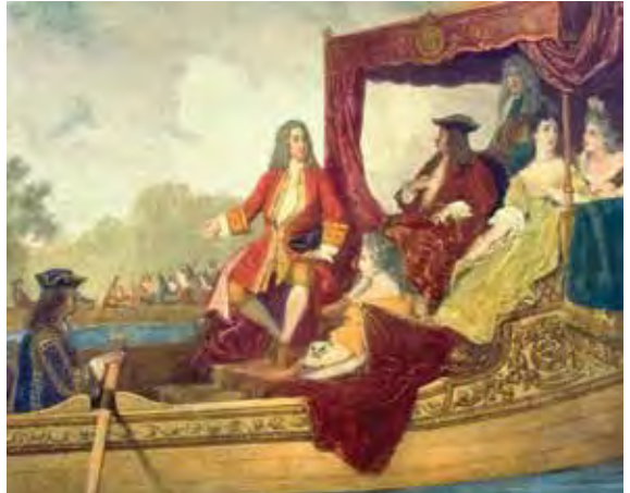
Handel (left) and King George I on the River Thames July 17, 1717. Painting by Edouard Hamman.

At about 8, the King took Water at Whitehall in an open Barge ... and went up the River towards Chelsea. Many other Barges with Persons of Quality attended, and so great a Number of Boats, that the whole River in a manner was cover'd; a City Company's Barge was employ'd for the Musick, wherein were 50 instruments of all sorts, who play'd all the Way from Lambeth the finest Symphonies, compos'd express for this Occasion, by Mr. Hendel; which his Majesty liked so well, that he caus'd it to be plaid over three times in going and returning. At Eleven his Majesty went a-shore at Chelsea where a Supper was prepar'd, and then there was another very fine Consort of Musick, which lasted till 2; after which, his Majesty came again into his Barge, and return'd the same Way, the Musick continuing to play till he landed.